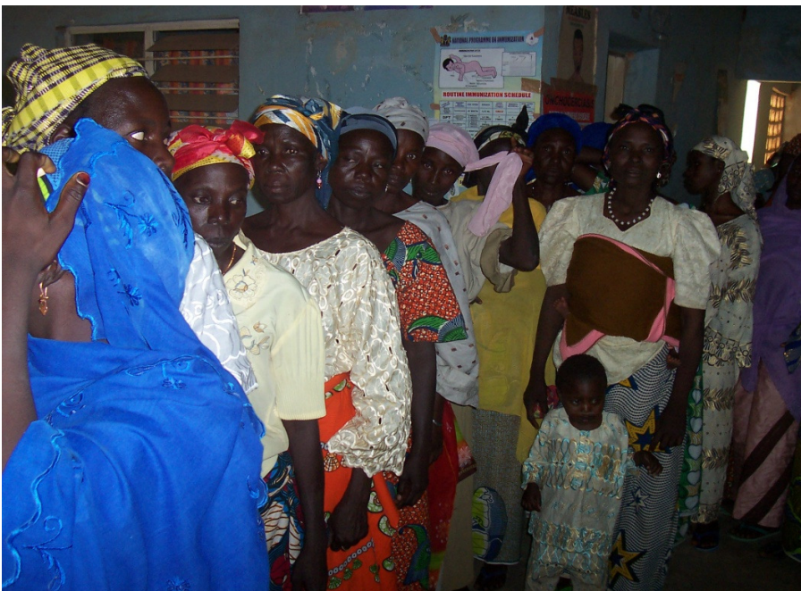
Women and children in queue being attended to at Zubulum medical outreach

DEF successfully organized a medical out reach to Zumbulum rural community in Borno State in September (17th to 19th, 2010). Health Education Campaign were conducted especially to discourage patronage of traditional bone setters (TBS) that often have medical misadventure when treating limb injuries that often result in gangrene (death of tissue) with consequent amputation. Common ailments like intestinal worms which to malnutrition and sometimes deaths were treated, while children with deformities / disability that needed surgical treatment/physiotherapy rehabilitation treatment were registered at DEF clinic based in Maiduguri for further evaluation and treatment.