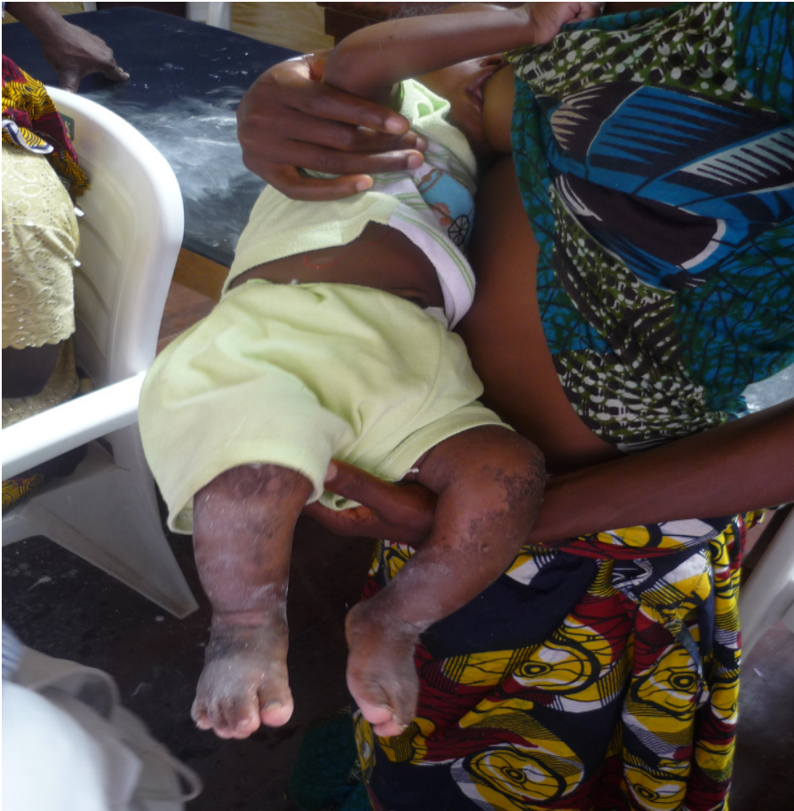
Fully Corrected club feet in the 4months old baby, after serial casting.