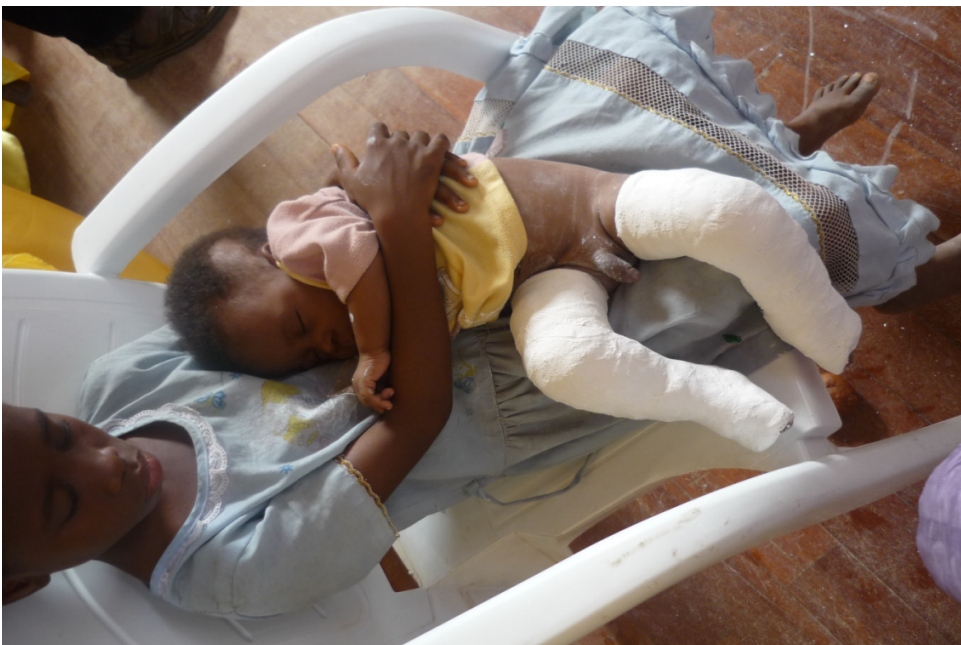
Serial Correction of club foot in progress in the 4month old by DEF volunteer Orthopaedic surgeons.