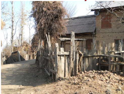
Budagam District Kashmir

(2) Kashmir: MEND is now supporting a new partner DaD ( Disabled and Disadvantaged) who have just held their first assessment camp on Dec.2 in a poor, remote district where militancy has been going on 17 years!