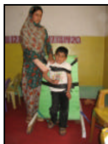
Standing frames train bodies to stand tall