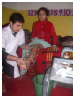
Home visit and followup