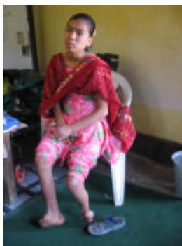
First arrival at Hope