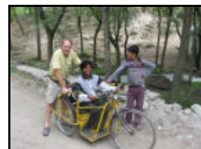
Local man shows us his hand tricycle