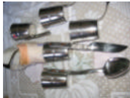
Earlier prototype of tools for daily living skills