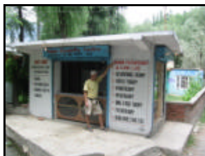
Rob at new Hope shop