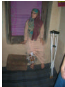
With pins removed