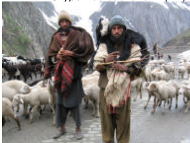
Pashima herders Kashmir