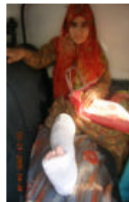
2 months later