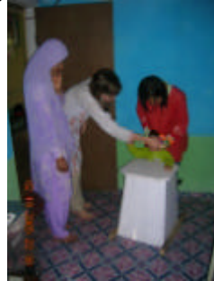
In standing frame