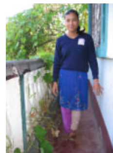
After 3 surgeries